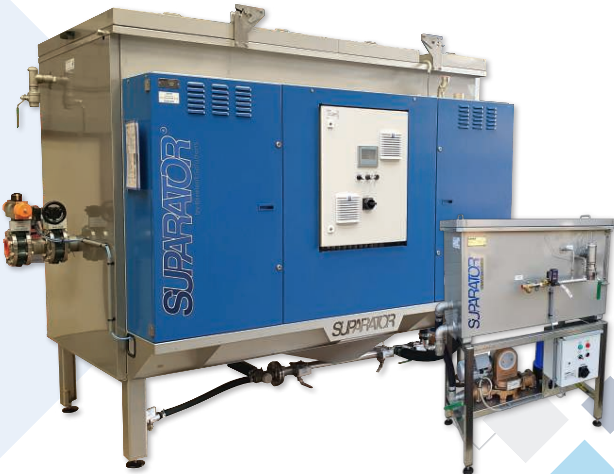
Suparator® dynamic oil separation systems are available in many different sizes. Above two examples; type 88/3000 Package Unit (left) for the treatment of large volumes as used in the automotive industry, and type 86/240 (right) for smaller volumes.

To make Suparator® extra attractive for machine manufacturers, we have a special so-called OEM-version. This is a set, containing a Suparator® System but without control system and frame. This makes it easy to integrate our parts into your machine using existing facilities, such as the control system. We advise you how best to do this and provide the necessary information. In this way we make our expertise available to you and we take responsibility for the result. Less is more..