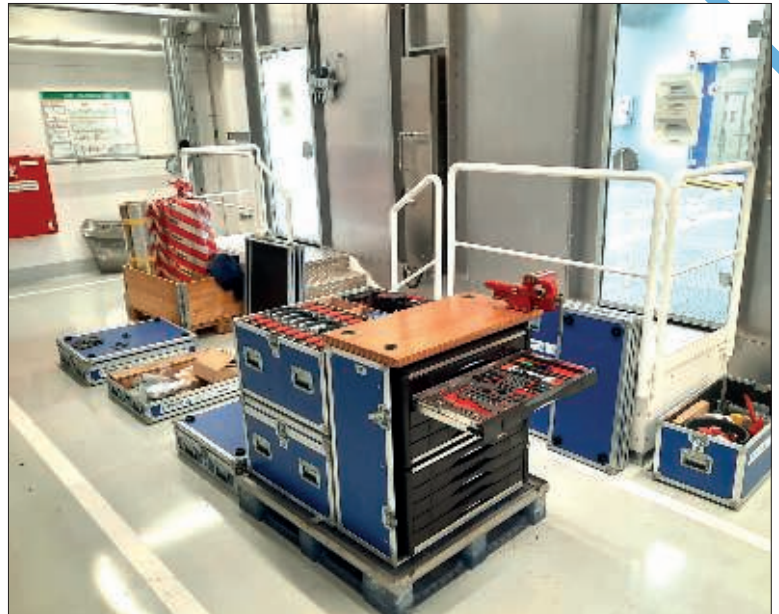
Maintenance Flight Case System containing tools and parts.

Furthermore our maintenance engineer brings our Flight Case System. This is a comprehensive kit which includes all necessary tools, wear parts and strategic replacement parts. Once on site, our engineer is self-supportive to a very high level which enables him to work very efficiently. This approach, combined with our expertise, will limit the down-time of your equipment.