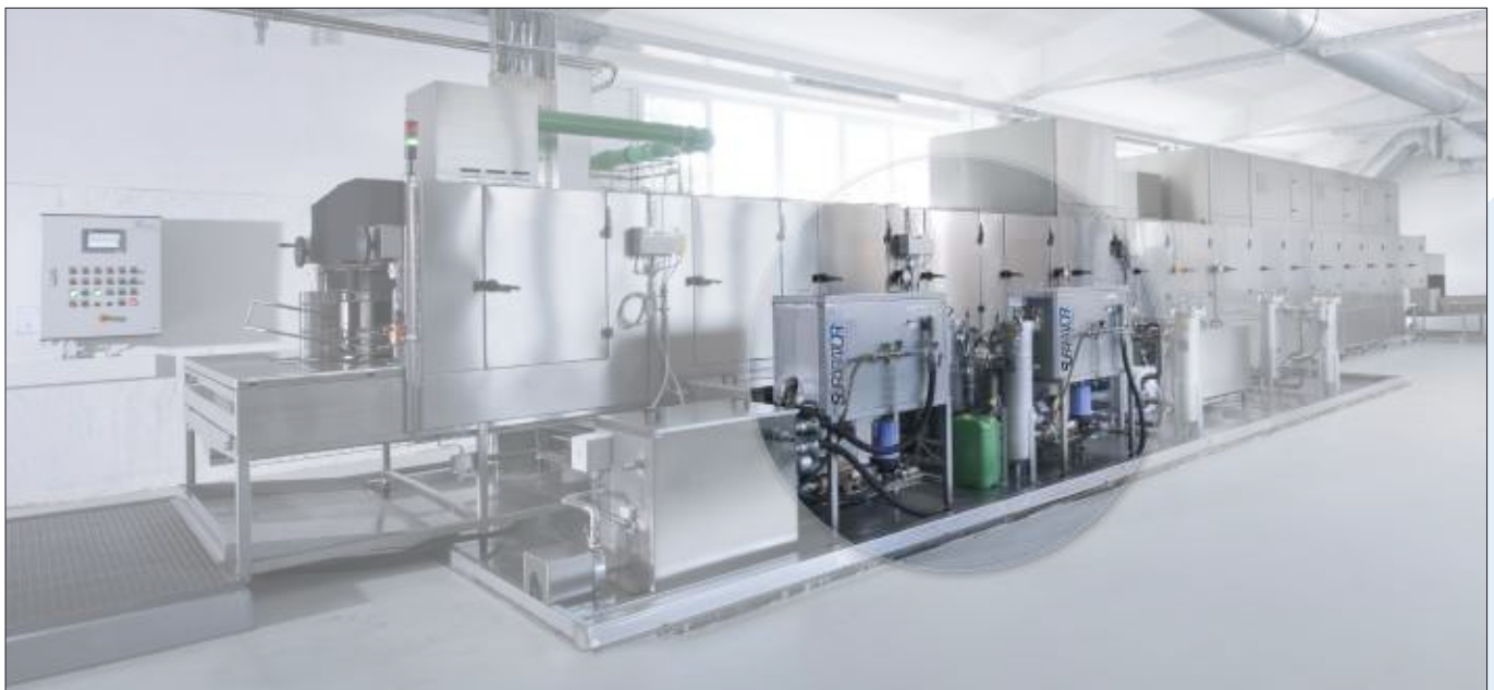
Two Suparator® oil separation systems, type 86/240 integrated in a tunnel parts washing machine.