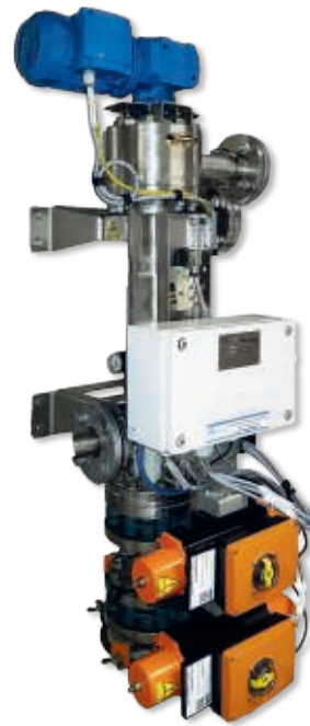
Q-Mag® fully automatic self-draining magnetic separator.