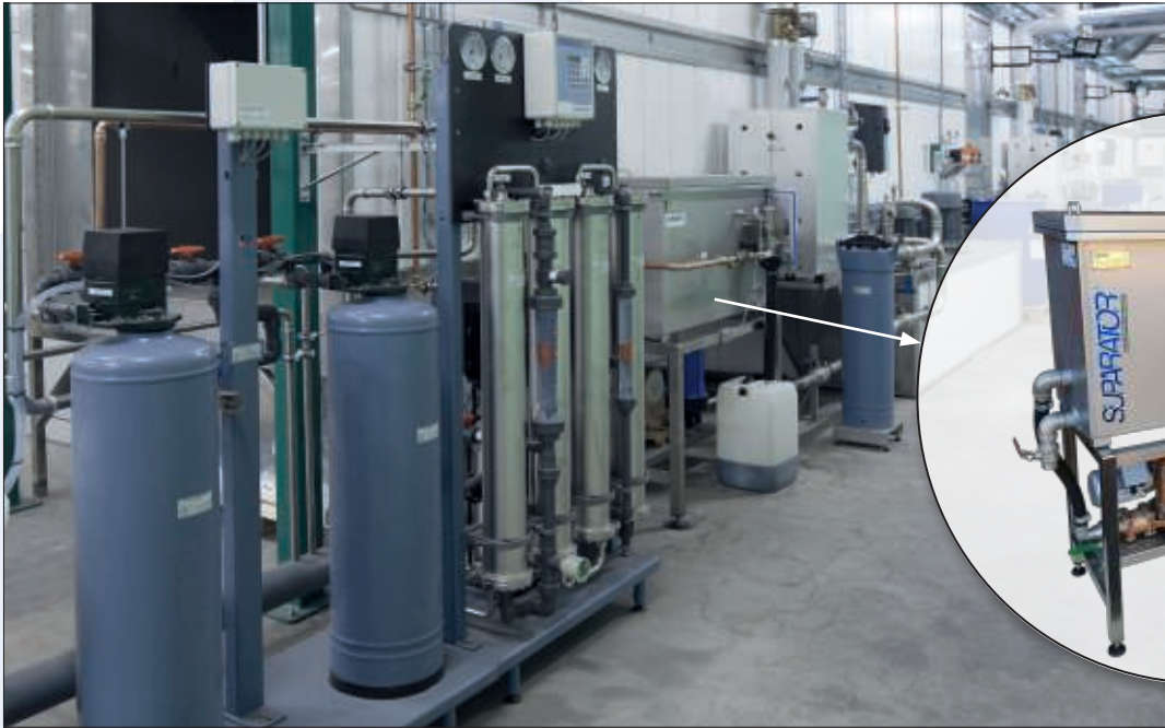
Suparator® dynamic oil separation system type 86/240. Typical example of modular integration in an automatic paint line.