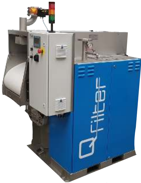
Q-Filter® active vacuum filter, type QF150 for filtration down to 5 µm.