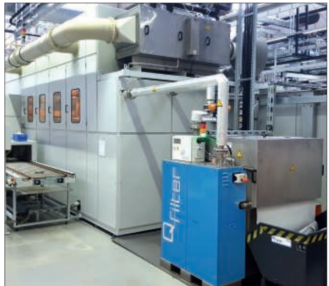
Q-Filter® active vacuum filter, type QF150 integrated in a precision parts cleaning machine.

Development never ends; there are always possibilities for improvement or better alternatives. We have been developing and improving our products for more than 25 years. So we know very well what our products can or cannot do. We continuously improve them and regularly release new versions, options or extensions. It gives us the perfect starting point to offer solutions with performance warranty.